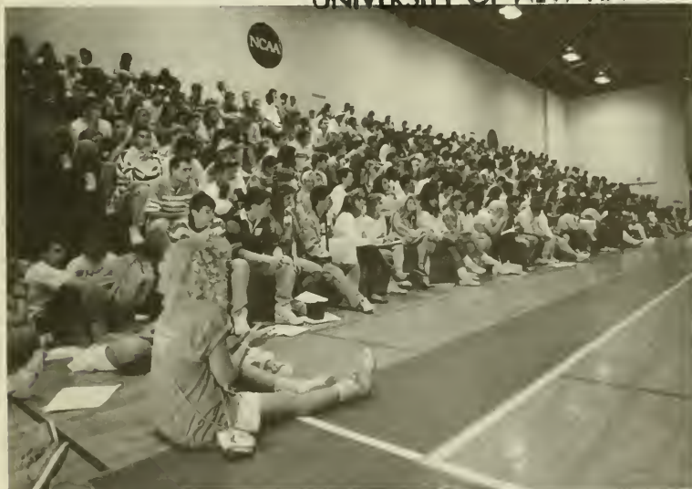
Freshmen and transfer students gathered in the North Campus gym to hear greetings from university officials on the first day of their two-day orientation.

Incoming freshmen and transfer students in the day division were welcomed to UNH Tuesday, Sept. 6 as part of a two-day orientation presented by the Office for Student Life.